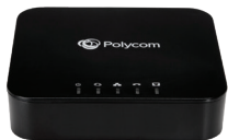
Polycom OBi312 Device